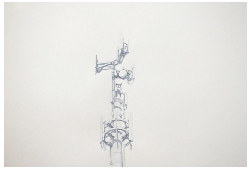
Quiet (1) - Pascale Rémita, 2009, 75 x 110 cm, watercolor

Text Aurélie Noury Curated by Mehdi-Georges Lahlou