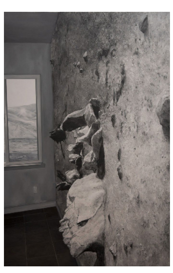
Catalin Petrisor, oil on canvas, 215 x 145 cm, 2012