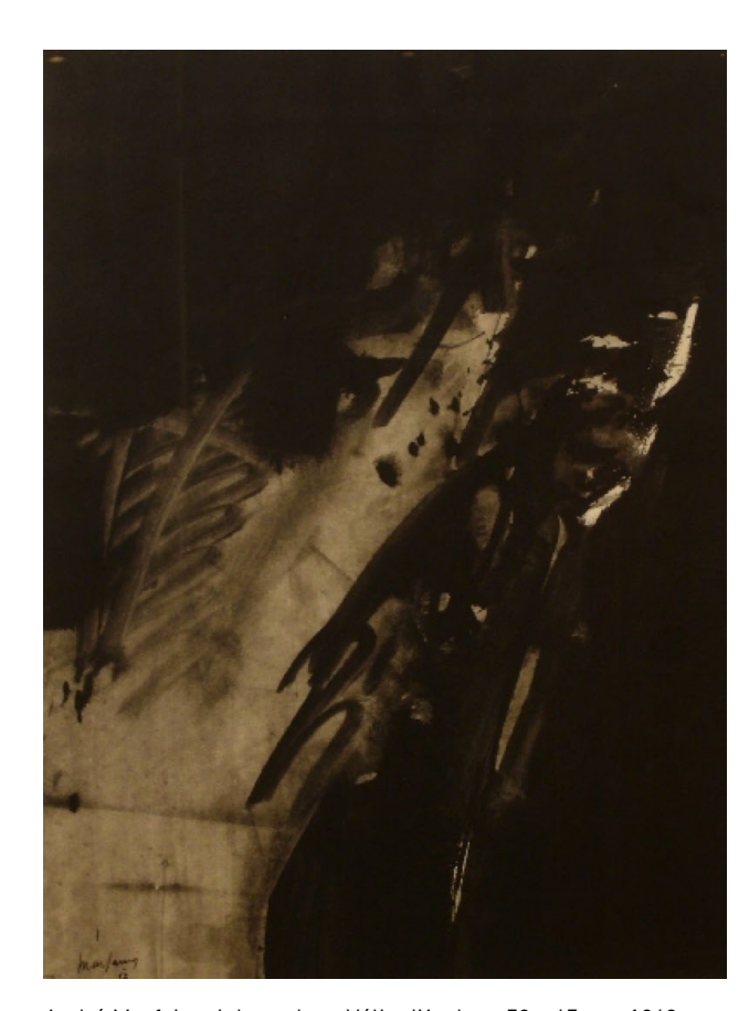
André Marfaing, ink wash on Vélin d'Arches, 50 x 65 cm, 1963