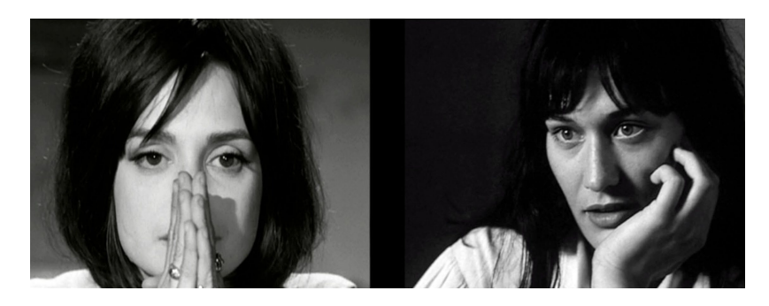
La Passerelle - Marion Tampon-Lajarriette Double projection video installation, black and white 6'00" in loop, silent movie 2007