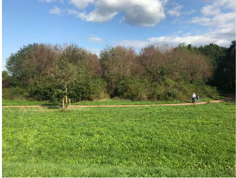
fig. 6 herman de vries, sanctuarium, 1999–2001. Earth, brick, steel, gold leaf, Briar rosebushes ( Rosa canina), stone, Ø30 × 3.3m. Zeewolde, Netherlands.