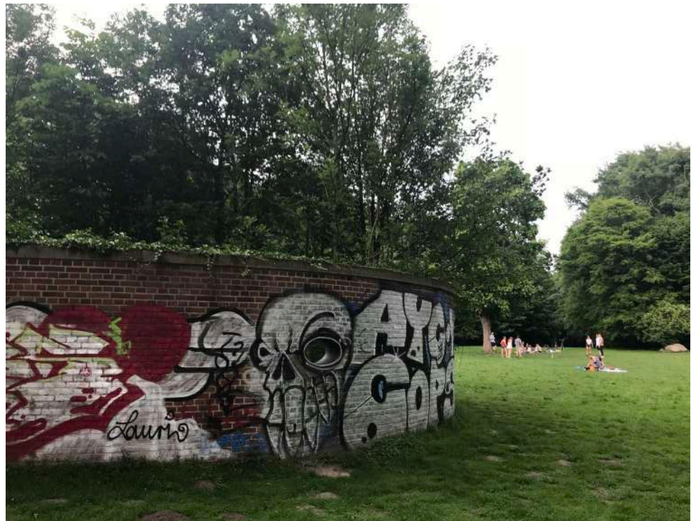
fig. 5 herman de vries. sanctuarium , 1997. Brick, sandstone, gold leaf, earth, Ø12 × 2.85m. Münster, Germany.

If in Stuttgart de vries’s universal ideal of non-intervention was charged with site-specific political potency, in Münster we encounter various vernacular appropriations that subvert the very principles that underlie the work, repurpose it, and reshape its affectivity. Local residents design nature by “seed bombing”, scientists “objectify” nature by tracking and quantifying, and graffiti artists infuse the work with a sense of confrontational urgency—a far cry from de vries’s ideal of harmonious, meditative contemplation. Moreover, while in Stuttgart