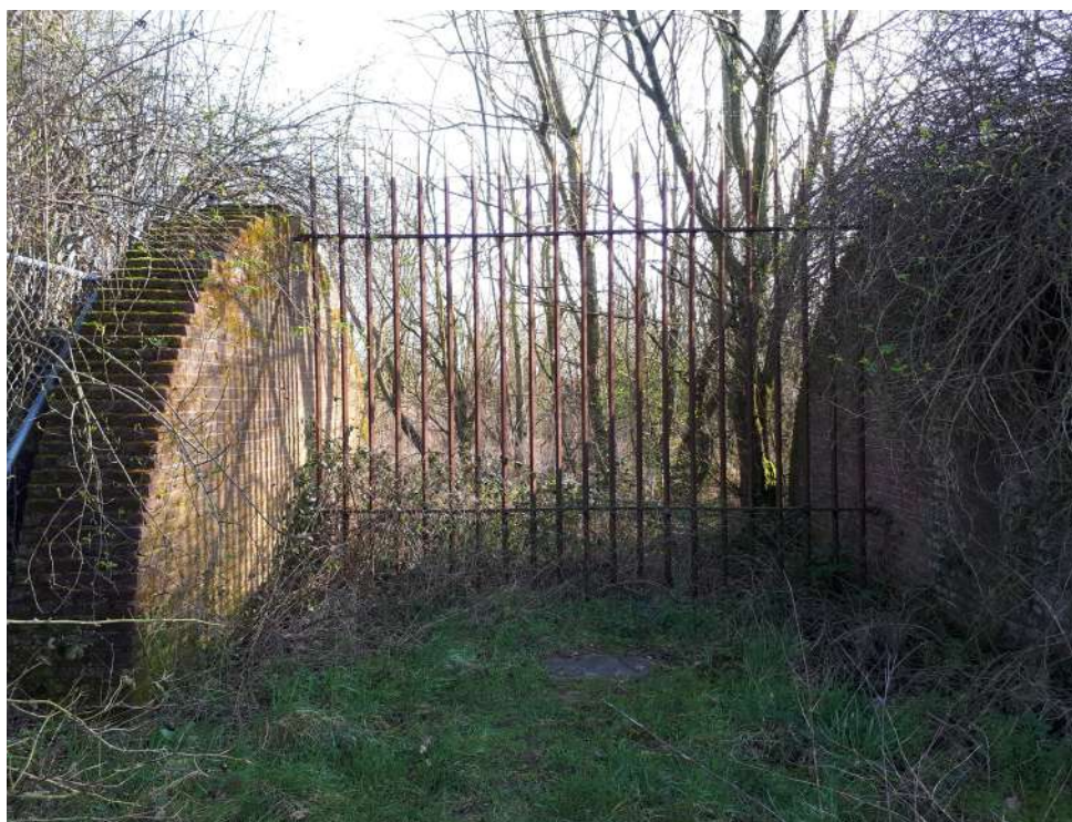
fig. 6 herman de vries. sanctuarium , 1999–2001. Earth, brick, steel, gold leaf, Briar rosebushes ( Rosa canina ), stone, Ø30 × 3.3 m. Zeewolde, Netherlands.

Just in front of the opening lies, almost secretly, a small, flat rectangular stone, reminiscent of an entrance rug, on which the artist engraved the words: “to be”—one of his favorite existential mantras, typical of his laconic use of language and his primary philosophy of pure presence: simply “to be” with nature (how can one “be” with nature when one is so thoroughly barred from it? This is one of the problematic paradoxes of the sanctuaries, but its consideration exceeds the scope of this paper). Art historian Claudio Pizzorusso finds a parallel between de vries’s simplified lingo to the teachings of Saint-Francis, who conveyed his