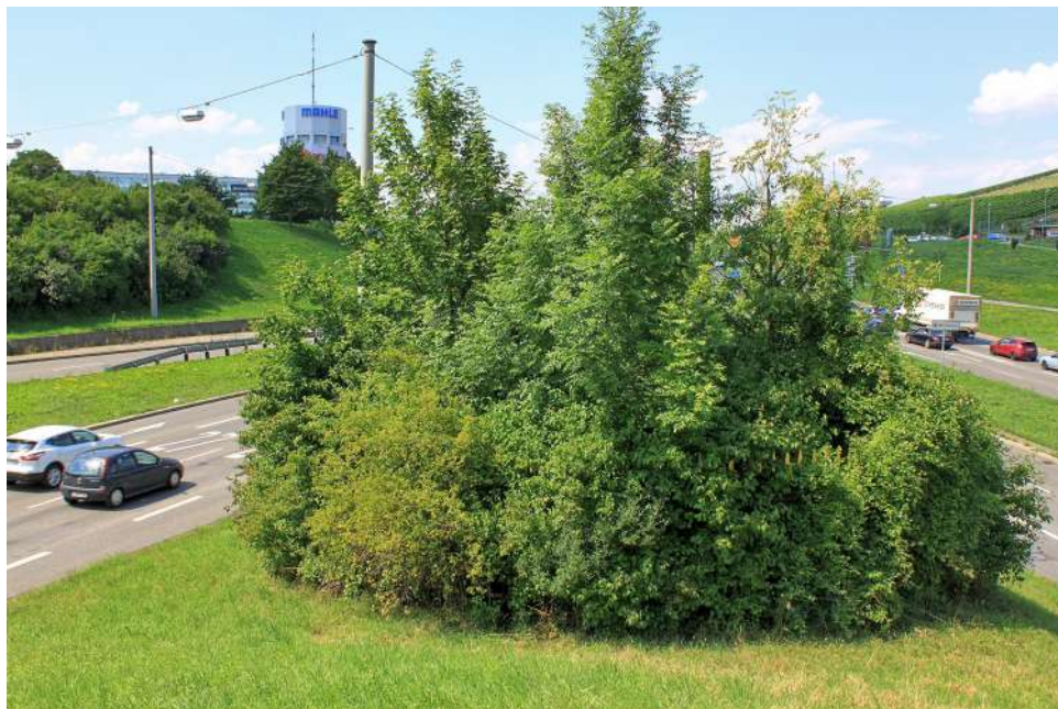
fig. 1 herman de vries. sanctuarium , 1993. Steel, gold leaf, earth, Ø12 × 2.85m. Stuttgart, Germany.

official request for clarification with the city council for this “ruthless” action, 39 and finally the mayor apologised and promised it would not happen again. Only members of the conservative Christian Democrats said that the work “screamed” for this cut and that it actually did the artist a service by increasing his market value. 40