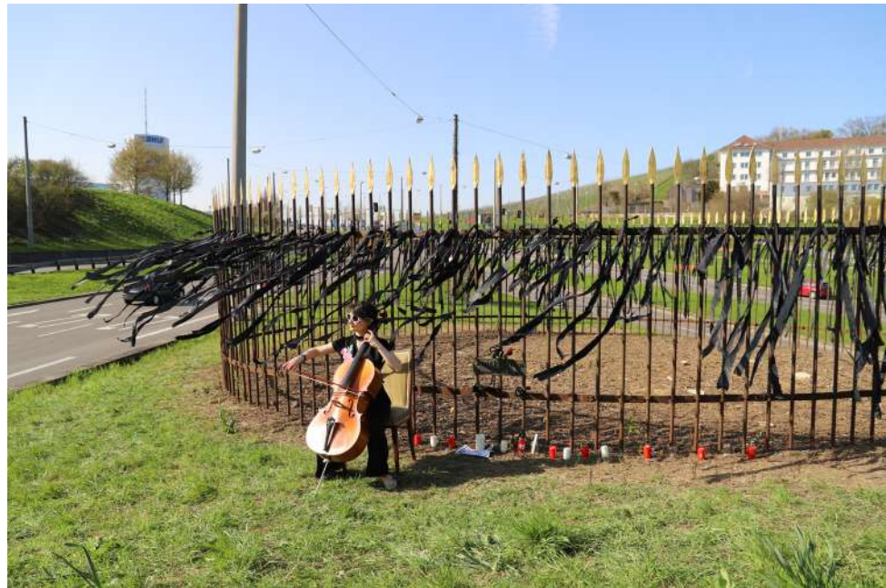
fig. 2 herman de vries. sanctuarium , 1993. Steel, gold leaf, earth, Ø12 × 2.85m. Stuttgart, Germany.